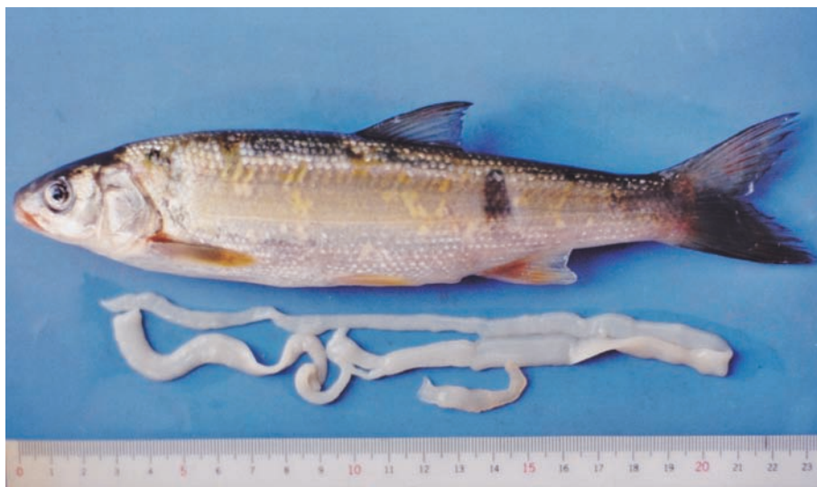
Fig. 2. A plerocercoid of Ligula interrupta Rudolphi, 1810 from a Japanese dace ( Tribolodon hakonensis ), 189 mm in standard length, collected in a brook flowing into Lake Okutone, Gunma Prefecture, central Japan, on 7 September 2000.

Remarks: Recently, Digramma has been regarded as a junior synonym of Ligula (Kuchta et al. , 2008). Awakura (1994) summarized the information on this cestode (as D. interrupta ) from cyprinid fishes in Hokkaido.