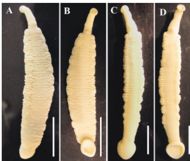
Fig. 2. Limnotrachelobdella okae (fixed specimens) from a Japanese amberjack Seriola quinqueradiata cultured in Tsukumi Bay, Kyushu, Japan. A. a large specimen, dorsal view, B. same, ventral view, C. a small specimen, dorsal view, D. same, ventral view. Scale bars: 20 mm in A and B, 10 mm in C and D.

According to the fish farmer who requested us fish examination, the fish examined had been