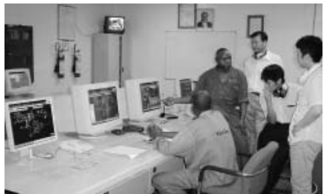
ケニアJBICプロジェクト評価事業 JBIC EX-post Monitoring and Evaluation in KENYA