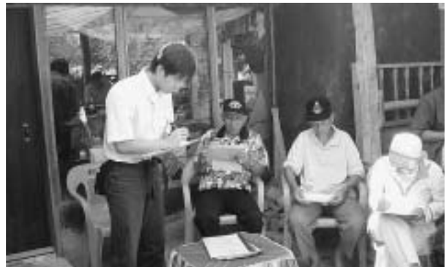
インドネシア農業灌漑用水事業 Decentralized Irrigation System Improvement Project in INDONESIA

As the incentive support period draws to a close and the i-ECBO program embarks on a new period of self-reliance, it is also confronted with a mountain of challenges. These include, for example, revisions of the curriculum that combines the internships with the PBL coursework, management of the responsibilities of academic staff including TA and RA, strengthening the