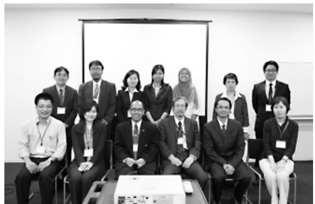
The chair persons, presenters and some participants at the symposium of "Designing Low Carbon Societies in Asia" as a part of URBIO 2010 International Conference