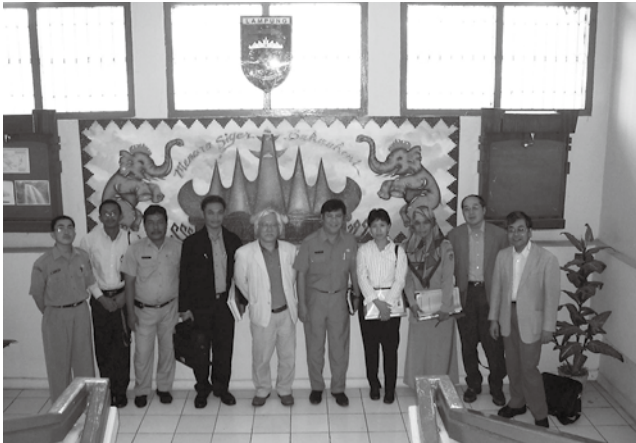
インドネシア地方政府における水質モニタリング事業の 現況調査 (2007年、南スマトラのランブーン) Survey on the Project of Water Quality Monitoring with the Indonesian Local Government (South Sumatra in 2007)

Finally, I would like to say thank you very much for your cooperation and assistance.