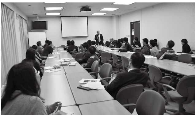
LBJ-UT/A の研究科長を招いてのセミナー The seminar at IDEC with the Dean of LBJ-UT/A

The SEP offers two practical lectures on development project management and career development as well as specially coordinated internship and field work in addition to the IDP that are of direct benefit to applying careers in international organizations. The course can be tailored and managed jointly by student, supervisors and professional mentors with use of E-Learning Portfolio. The additional benefits and educational services to students in the SEP program will be continuously prepared.