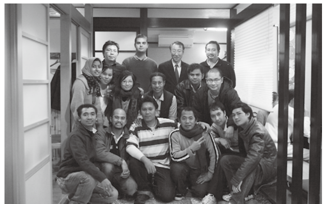
ゼミ生たちと、新年会にて New Year Party with Students

I would like to thank my colleagues in development policy course, who always guided me in friendly atmosphere. I would also like to thank colleagues from other courses in different disciplines. From them I learned many different "academic cultures", which widened my view. I also like to thank people in administration office. Their assistance and support were always positive and professional. My last but not least thanks go to the fellow students. For me teaching