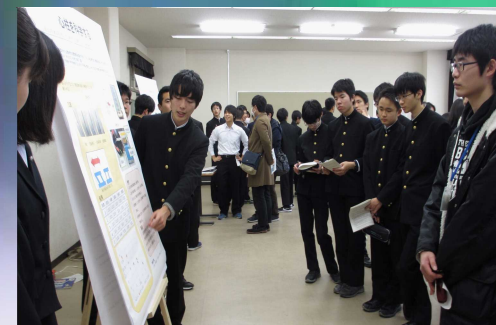
Research Project Presentation