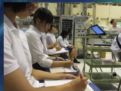
Science Project Tour