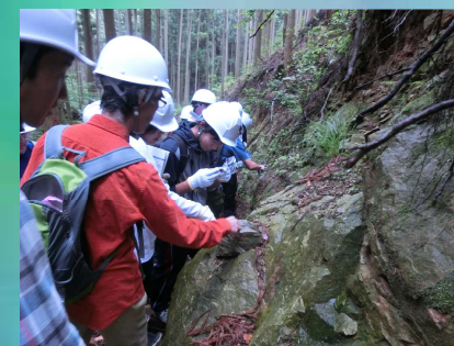
Pioneer Studies in Science: Field study in geology