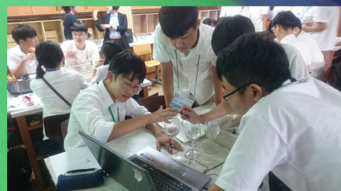
cooperative research program in Korea