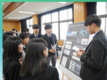
Students in Korea visit Japan for cooperative research program