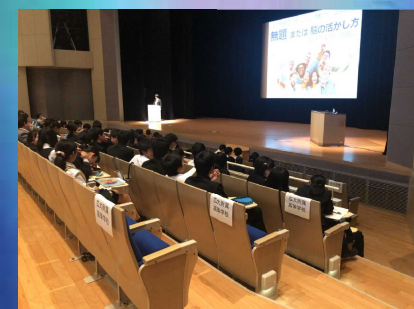
Hiroshima University Advanced Placement