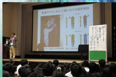
Integrated Science: Science and Ethics