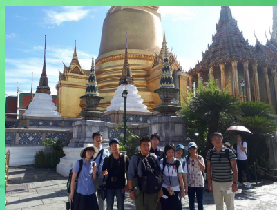
cooperative research program in Thailand