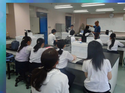
Pioneer Studies in Science: Biology