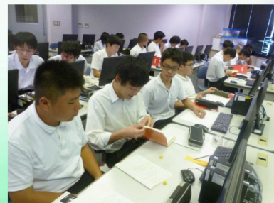
AS Statistics for Science

Based on the curriculum development by the third stage of SSH, develop interdisciplinary curriculum, which forms the basis of the “research project”.