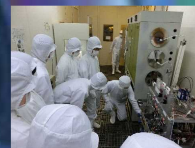
Pioneer Studies in Science: Nanodevices