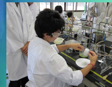
Pioneer Studies in Science: Chemistry